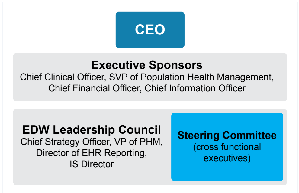
Figure 2. Partners EDW governance structure

Governance. Partners implemented a governance structure to provide overall executive guidance on priorities, access, and ensuring effective project execution. This structure was based on three components (Figure 2). The executive sponsors hold ultimate accountability for the project and provide strong leadership guidance and make prioritization decisions. The leadership council oversees day-to-day management of the project and is supported by the steering committee—a large advisory group composed of key stakeholder groups that functions as a sounding board for ideas.