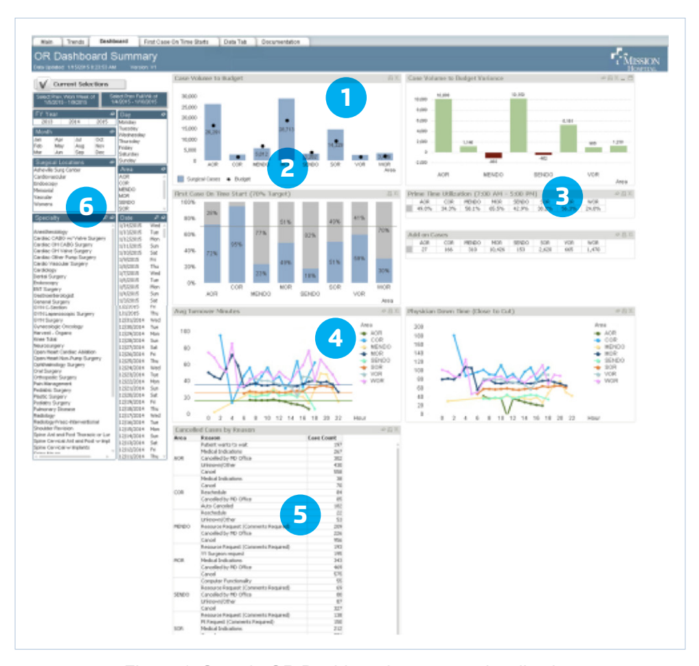
Figure 1. Sample OR Dashboard summary visualization