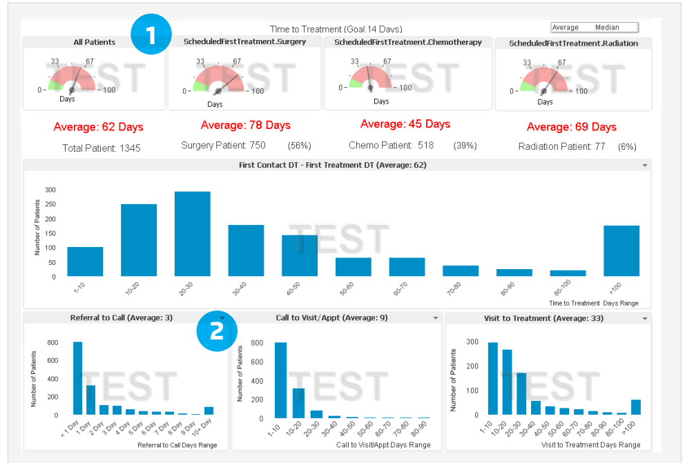
Figure 2: Time to Treatment Sample Visualization