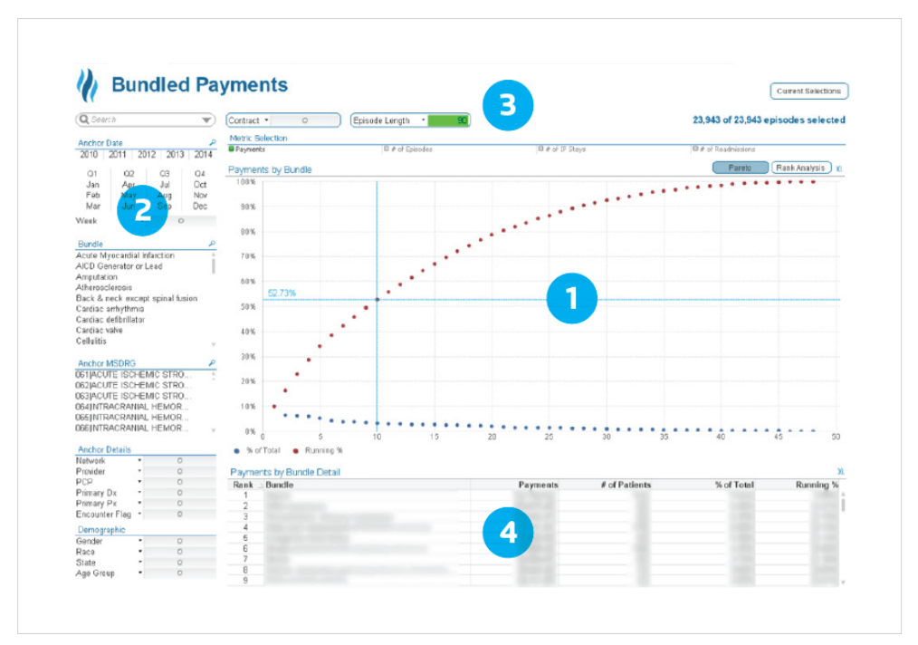
Figure 1: Sample Bundled Payments visualization

of variation (the ratio of the standard deviation to the mean), is displayed on the Y-axis. This has become an important strategic concept for Mass General Brigham in determining the appropriate area of focus (see Figure 2). Using this visualization, bundles/ episodes that are highly variable and resource-intensive are found in the chart's upper right quadrant, making them easy to identify and further investigate.