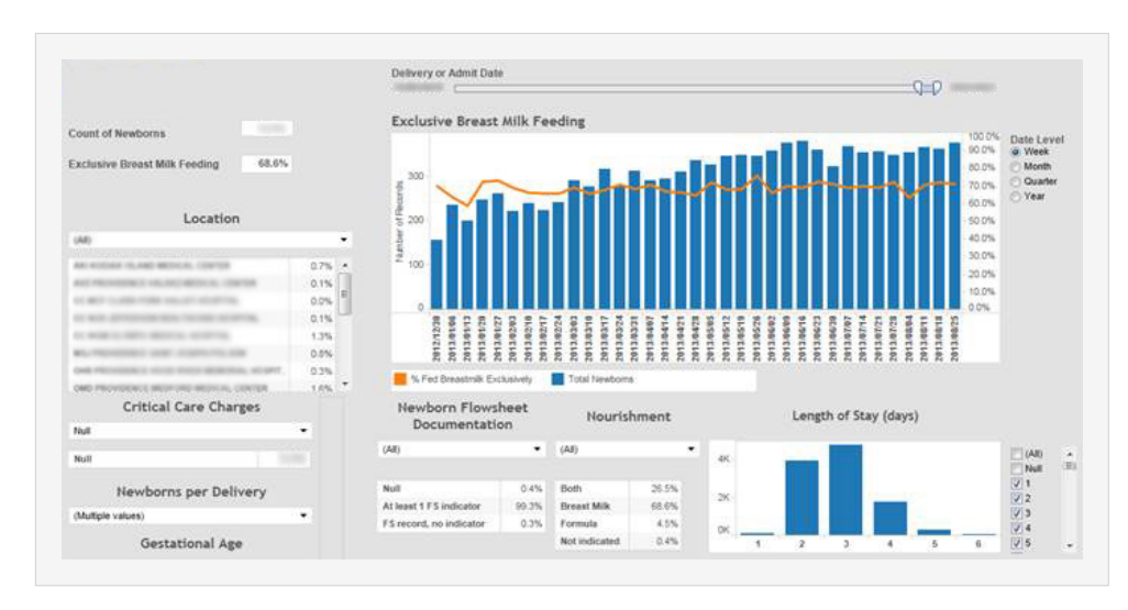
Figure 2: LOS less than or equal to 6 days

Just looking at the metric, one might conclude that LOS drives whether or not a mother breastfeeds. However, because the team was able to drill down further into the data using the application, they could see that the deliveries with longer LOS typically involved either surgery (e.g., a C-section) or a newborn complication that interfered with exclusive breast milk feeding. This kind of self-service analysis helped the team target its improvement efforts more accurately and effectively.