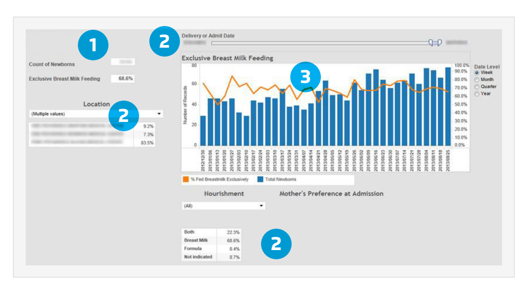
Figure 3: Sample breast milk feeding visualization

The clinical improvement analytics platform will enable the team to develop new dashboards to track compliance with improvement interventions and the impact of each intervention on the breast milk feeding rate. *