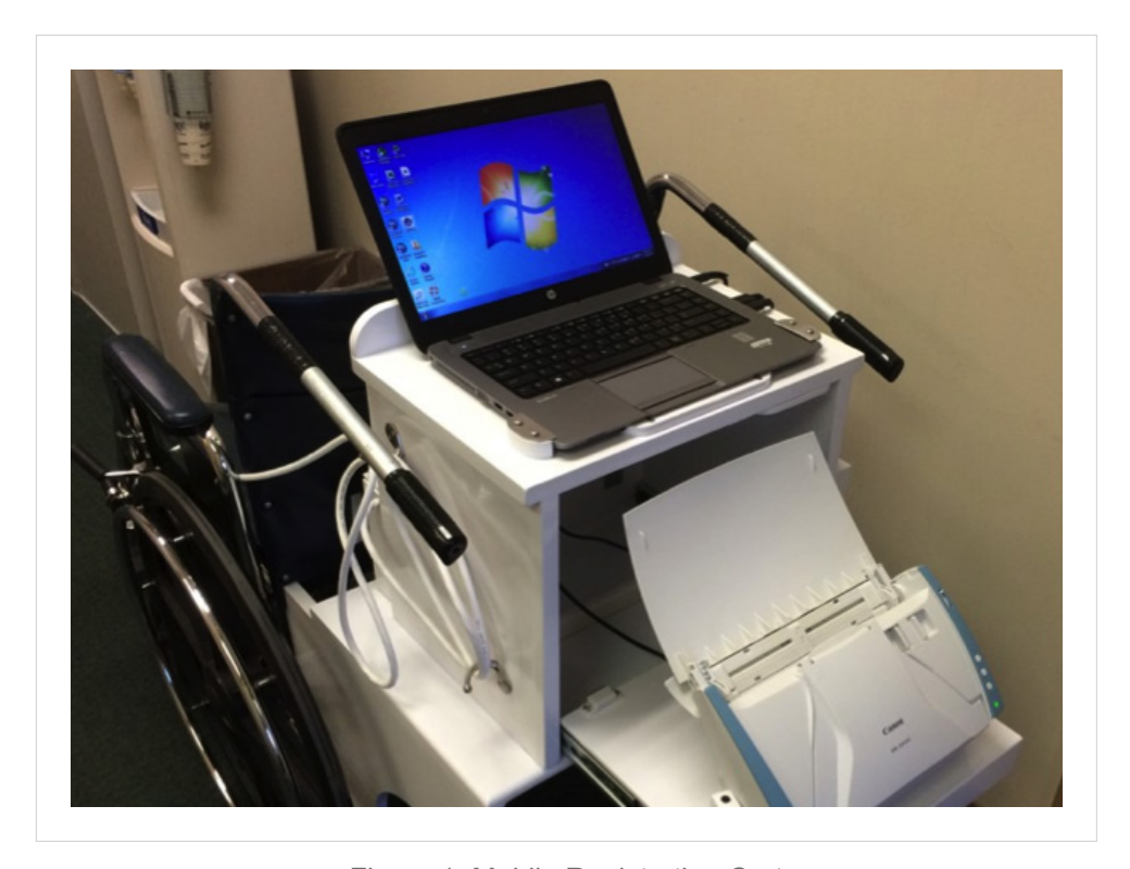
Figure 1. Mobile Registration Cart

To switch to mobile registration, Thibodaux needed a way to transport the patient to the room while carrying a computer and scanner. They reached out to their engineering department and presented them with the problem. Ultimately, Danny Hebert, a member of the hospital's maintenance crew, eagerly accepted the challenge. Hebert built an innovative mobile registration cart (see Figure 1) that was attached to the back of a wheel chair, yet still light enough for a registration clerk to push wherever the patient needed to go, included a back-up battery system, and a removable top that enabled clerks to place the laptop on a bedside table or counter in order to face the patient bed while they filled out the registration information.