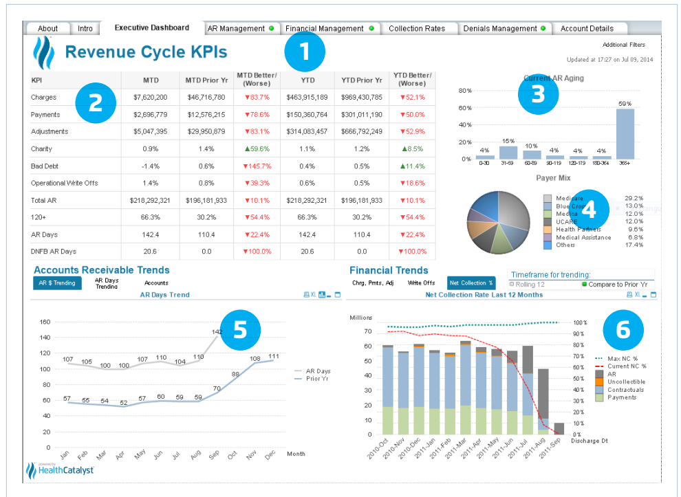
Figure 1 Sample Revenue Cycle Explorer executive dashboard.

The application enables the team to identify operational problems that can lead to denials. Figure 2 shows an example of the denials management dashboard that arranges denials into actionable categories. The revenue cycle team can quickly research by variance, denial code, location, payer, provider and CPT code (for professional billing) to identify root causes before they turn into